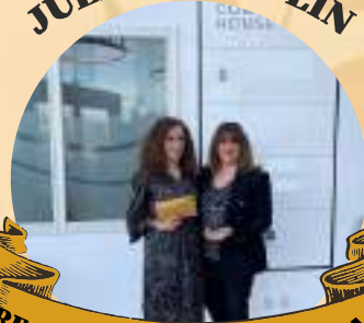
RECEPTIONIST OF THE YEAR