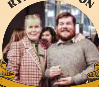
EMPLOYEE OF THE YEAR