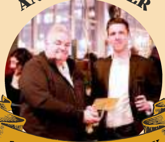
ALL DAY EVERYDAY