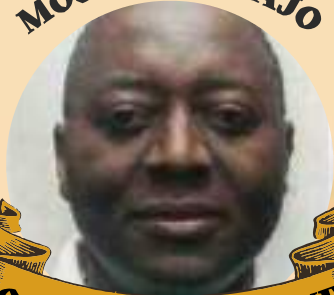
CONSIDER IT DONE