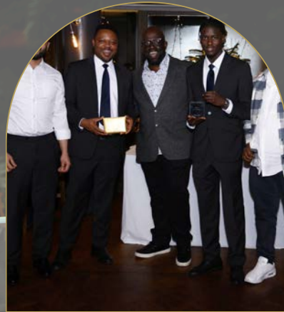
Team of the Year Lewisham Council